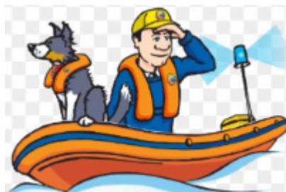
Happy Birthday United States Coast Guard

August 4 is National Purple Heart Day 2020. It is a time for Americans to pause to remember and honor the brave men and women who were either wounded on the battlefield or paid the ultimate sacrifice with their lives.