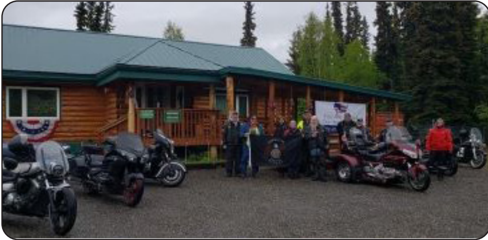
The American Legion Riders at Post 30 North Pole