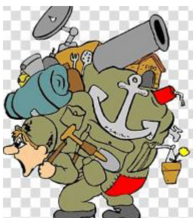
Happy belated Birthday United States ARMY