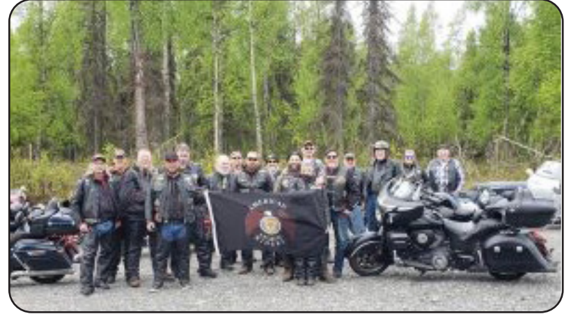
American Legion Riders annual trip to Byers Lake on Memorial Day weekend 2020