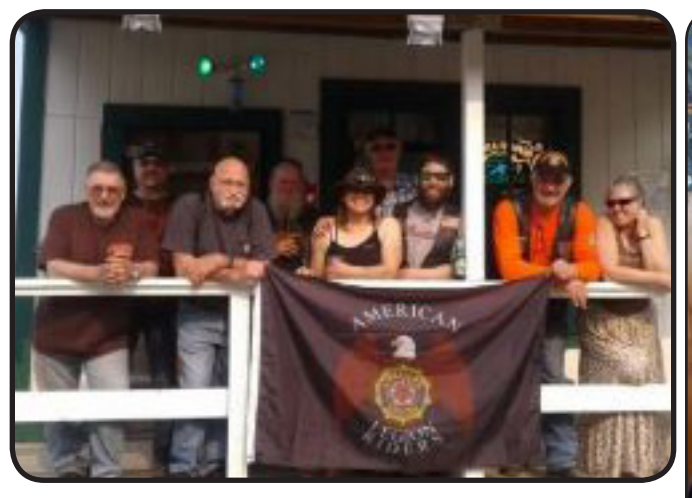
Stopping for pie at Hope Alaska. Must have been tasty, look at those happy faces!